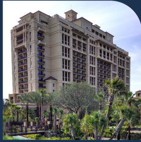
Disney's Pandora (Top Left), Disney's Ratatouille (Top Right), Salvador Dali Museum (Bottom Left), Four Seasons Resort (Bottom Right)